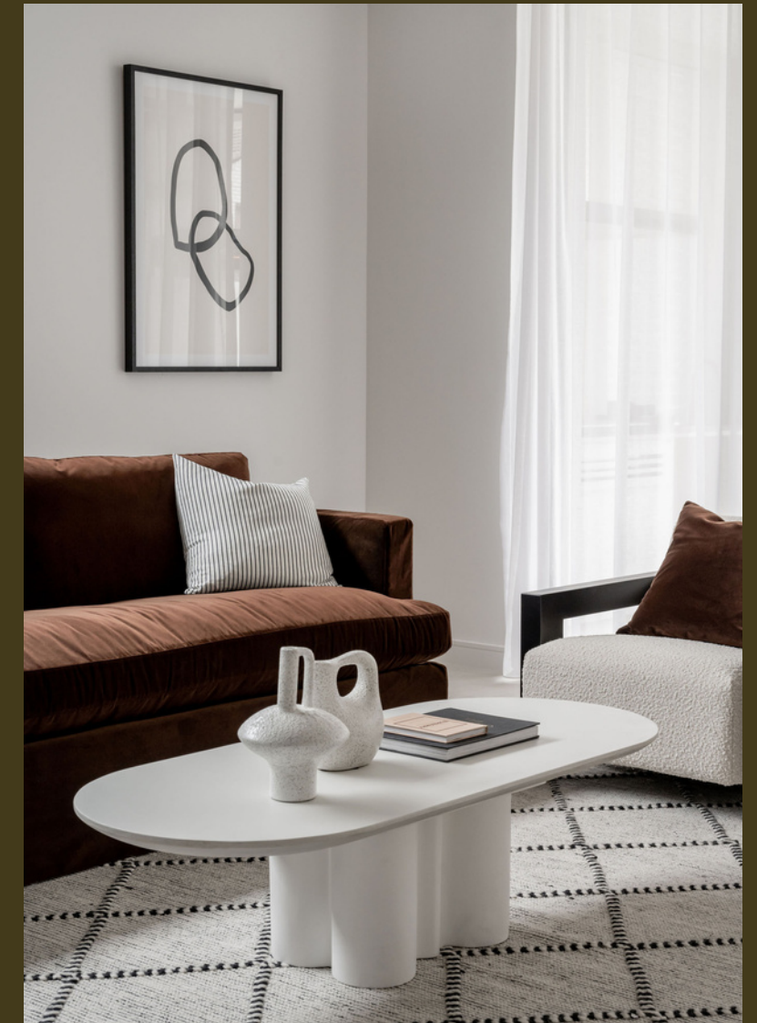
Commercial Special Projects